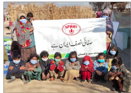
Health and Hygiene campaign in Meher Abadi Islamabad