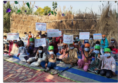
Universal Children Day, Meher Abadi Islamabad

Positive discipline techniques are applied to teach and discipline children in the centers.