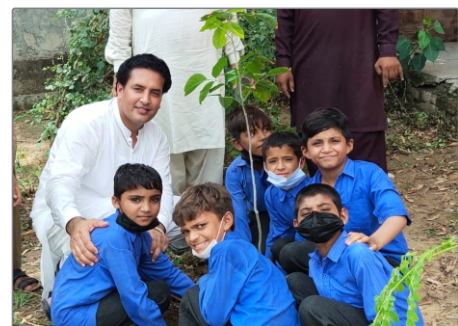
Plantation in Luk Government High School Lahore