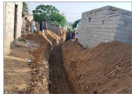
Construction of sewerage line in Meher Abadi Islamabad