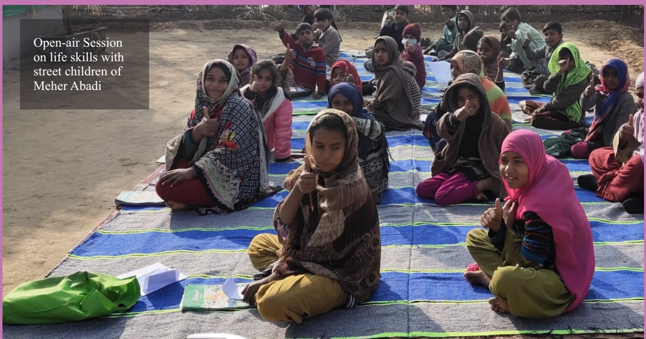
Open-air Session on life skills with street children of Meher Abadi

Evidence shows that by end of the Project the beneficiaries of the targeted community were experiencing a better life, children were enjoying their right to education; there were considerable decrease in practicing Physical and humiliation punishment in schools and in the community, and identity in the shape of B-Forms and CNICs was secured; children and parents were climates sensitized and the women and girls were involved in the income generation activities at door-step as a result of SPARC interventions.